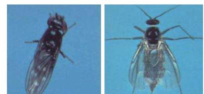
Adult shore fly (left) and adult fungus gnat (right). 1